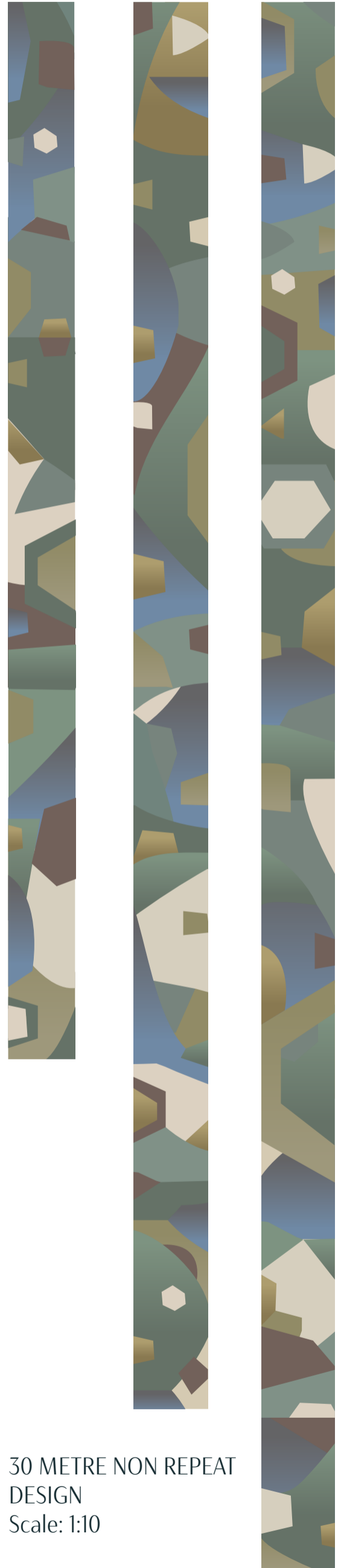
30 METRE NON REPEAT DESIGN Scale: 1:10