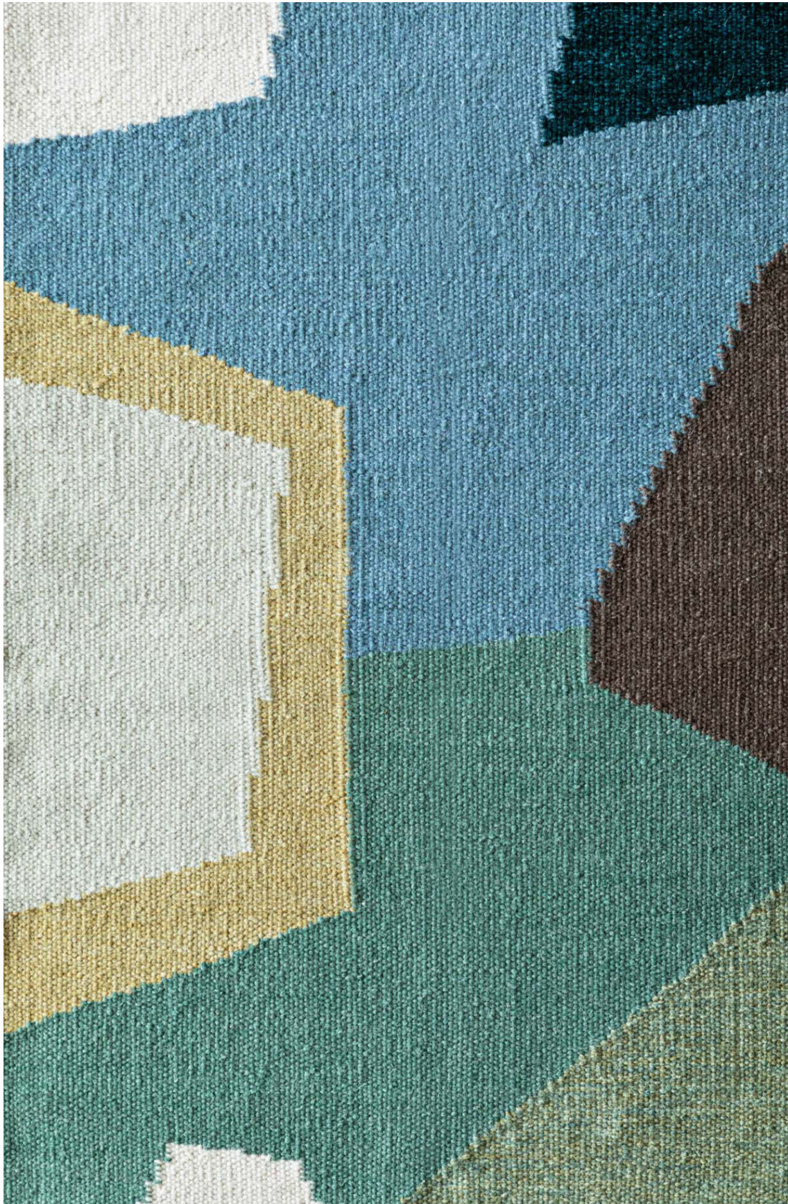
SAMPLE DETAIL SHOWN FOR COLOUR REFERENCE