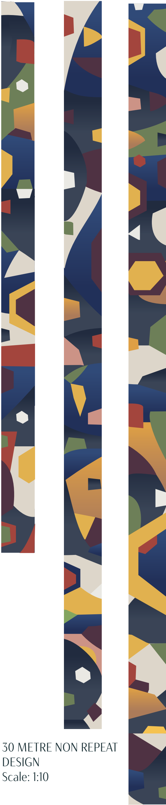
30 METRE NON REPEAT DESIGN Scale: 1:10