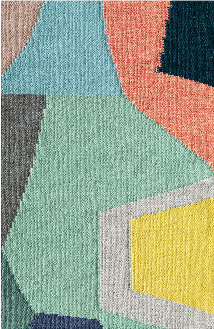
SAMPLE DETAIL SHOWN FOR COLOUR REFERENCE