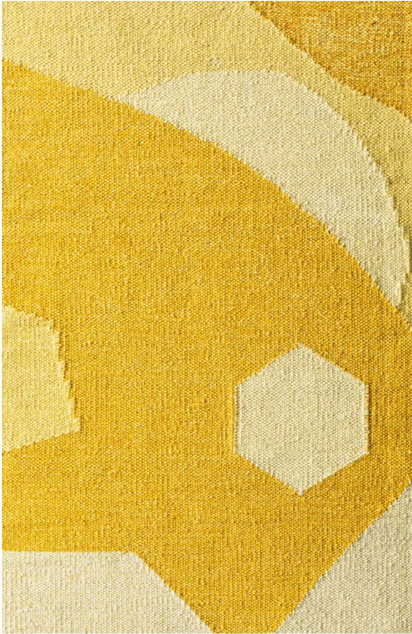
SAMPLE DETAIL SHOWN FOR COLOUR REFERENCE