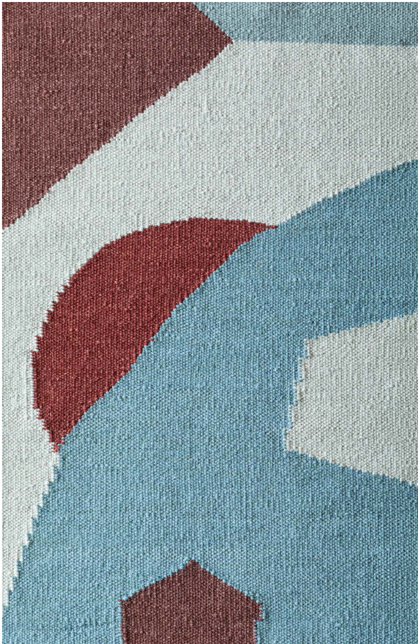
SAMPLE DETAIL SHOWN FOR COLOUR REFERENCE